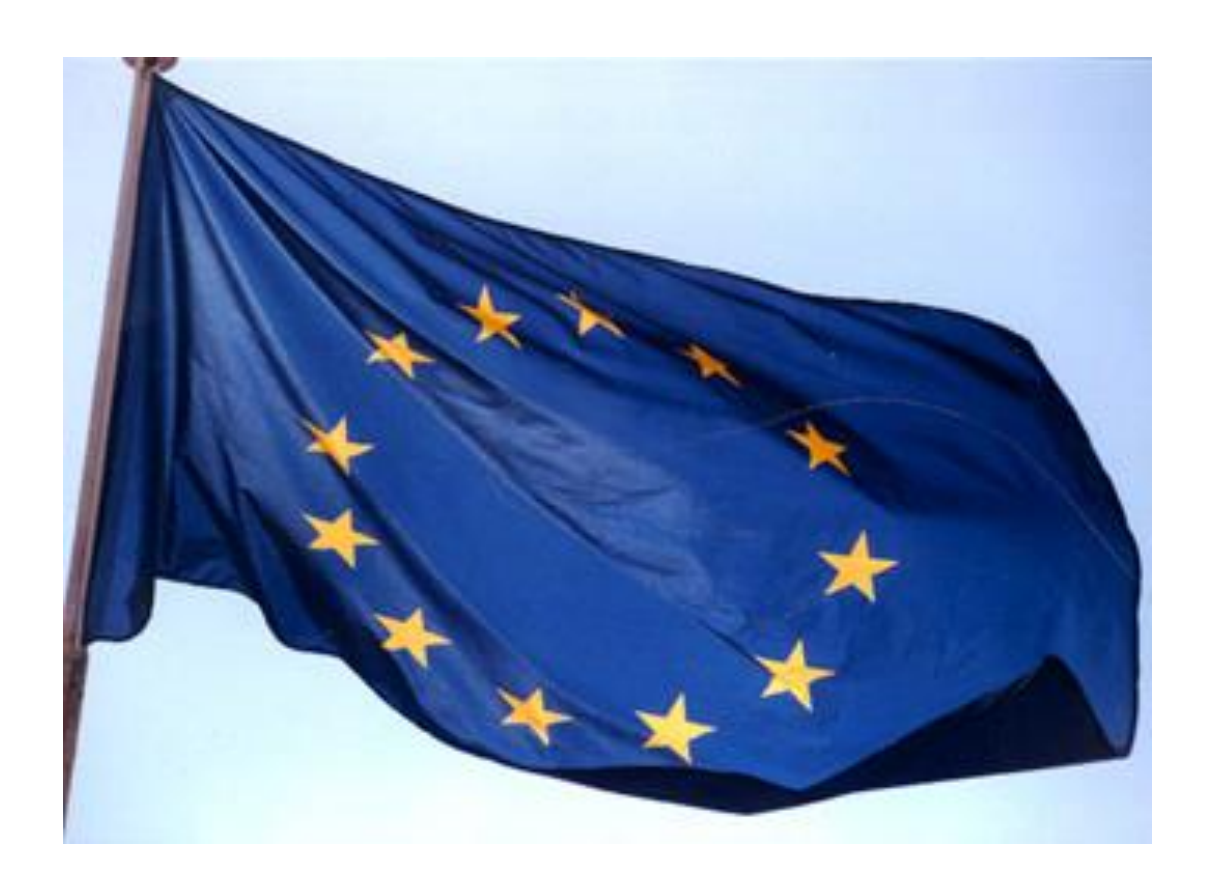
Thank you for your attention!